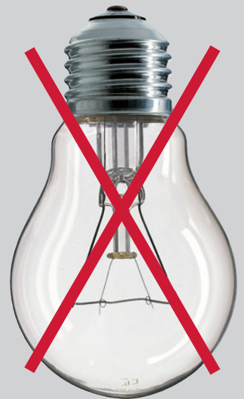
E27 base \geq 100 W

Examples of non-clear lamps: in the top row (from left to right) a frosted incandescent lamp with E27 screw base and two frosted candle-shaped incandescent lamps with E14 base, in the bottom row (from left to right) a frosted halogen lamp with R7s base and a frosted halogen lamp without reflector with G9 base. The bottom row also shows, on the right, a 100 W clear incandescent lamp with E27 base. These lamps stand for the group of lamps that may no longer be put into circulation as of 1 September 2009: non-clear incandescent and halogen lamps as well as clear incandescent and halogen lamps with a power rating of 100 W or more. From that date onwards, the only non-clear lamps allowed will be those with an Energy Efficiency Class A rating – e.g. energy-saving lamps.